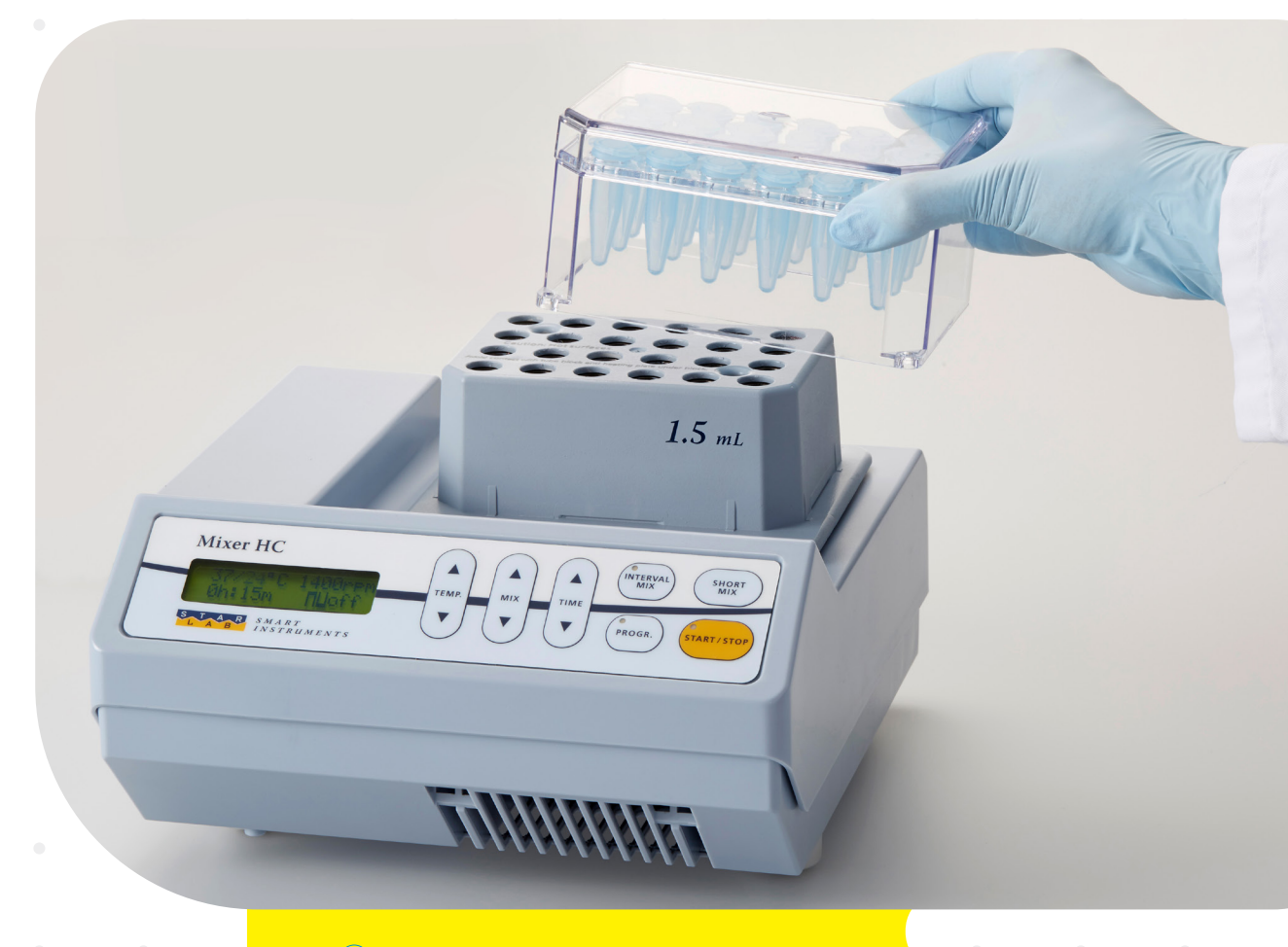
for 1.5 / 2.0 ml tubes